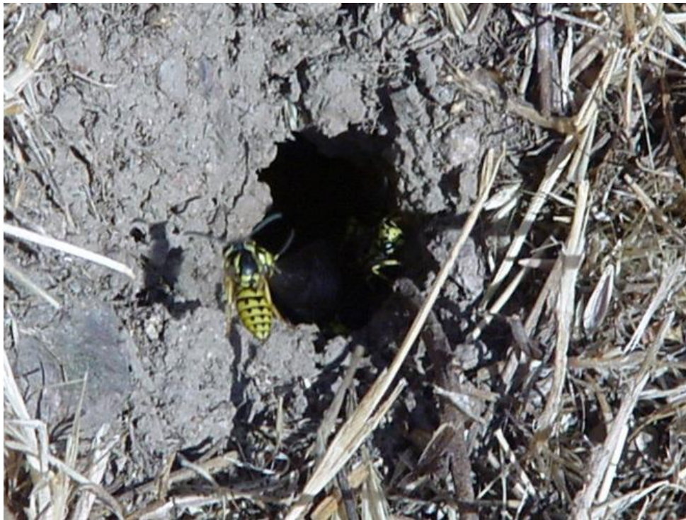
Yellowjacket entering underground nest