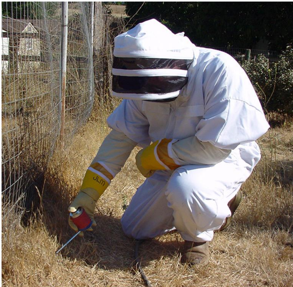
Treatment of located nest with Drione® dust

confirming the exact location of the nest. The assistance of the property owner is critical to the success of any yellowjacket eradication program. If the property owner is not sure about the location of a yellowjacket nest, district staff will conduct a search of their property for them. Once a nest location has been confirmed, district staff put on a protective bee suit and gloves, return to the nest site and place Drione®, a dry powered form of Pyrethrin, down into the nest. (Pyrethrin is an insecticide made from chrysanthemum flowers that is also commonly used on livestock and pets to manage other insect pests, including fleas.) Treatment of the nest with Drione® will usually kill all members of the nest within 48-72 hours.